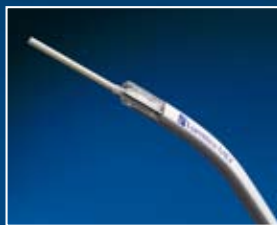
Optional extended tip provides (need info)

VersaLight can be inserted directly into deep cavities, small openings, under flaps, and in lateral margins. It helps to access, visualize, irrigate, and clear the surgical site, while saving operative time, space, and cost. Designed to attach easily to existing OR equipment, it requires no capital investment, and provides a lower cost-per-use.